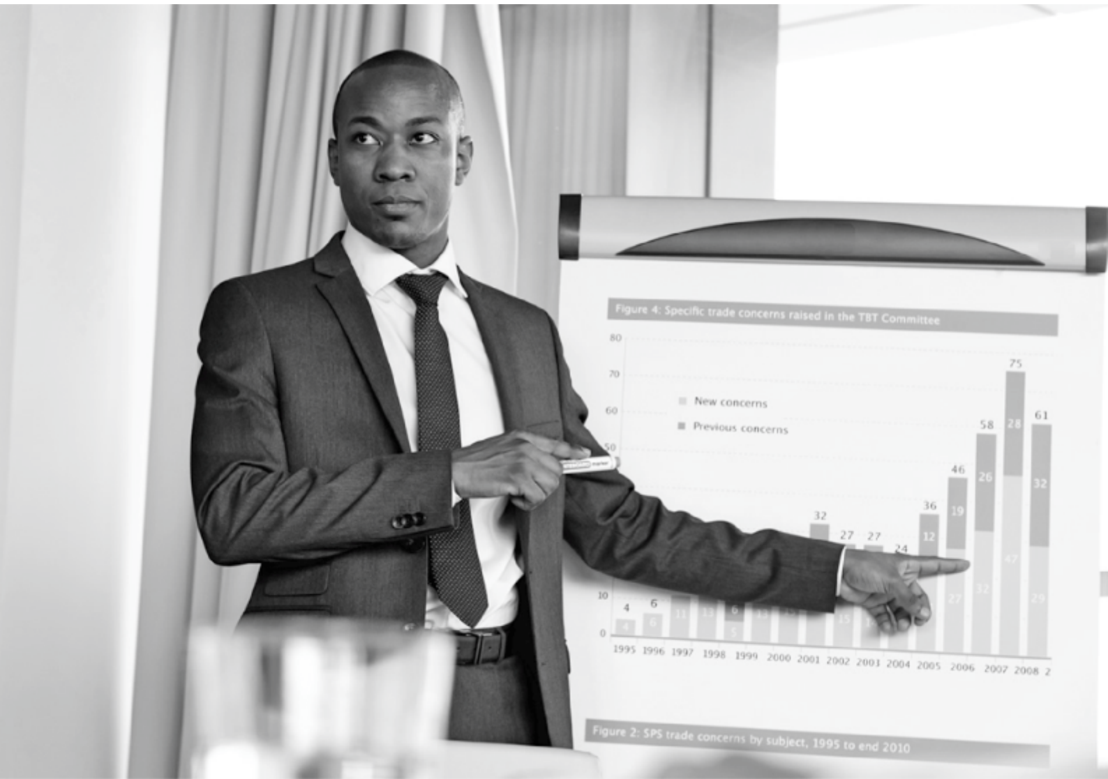
Figure 4: Specific trade concerns raised in the TBT Committee